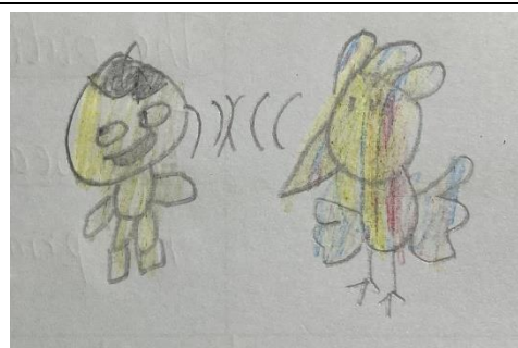
(Things you want to do)

I want to go to the Hong Kong Zoological and Botanical Gardens for a class outing. I can see different kinds of animals. For examples, blue-fronted amazon parrots, American flamingoes, golden lion tamarins and squirrel monkeys. I love parrots the most. They are cute and lovely. I want to go for the outing with my classmates in spring. The weather in spring is nice and warm. I want to have a picnic in the zoo with my classmates. I need to bring a lunch box, a bottle of orange juice and a bag of biscuits. After lunchtime, I want to go to find the parrots and chat with them. I wish I have a great day there with my friends.